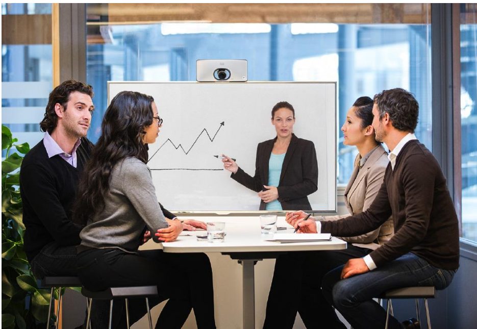
Figure 1. Cisco TelePresence SX10 in a Project Room Environment

High quality, simplicity, and affordability come together in the SX10 Quick Set to create a logical solution for video ubiquity (Figures 1 through 3).